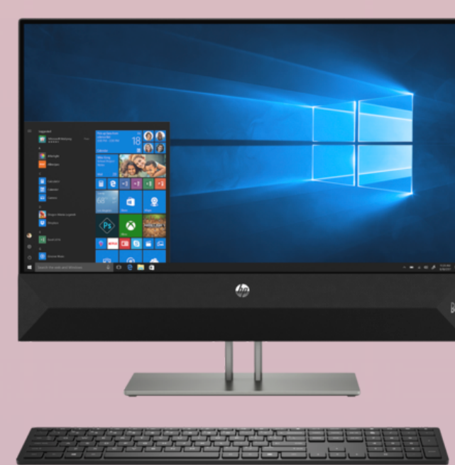
Computer or Tablet